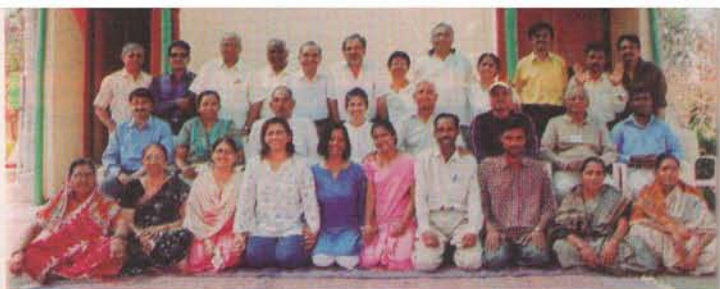
Sampoorna and the participants, along with the Arogyadham staff, exude the joy of life

www.biofieldsciences.com email : cbspune@biofieldsciences.com www.pipbiofieldimaging.com